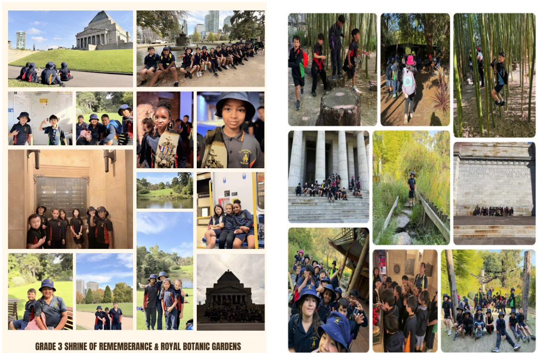
GRADE 3 SHRINE OF REMEMBRANCE & ROYAL BOTANIC GARDENS

N E W S L E T T E R Issue 2 15 th May, 2026